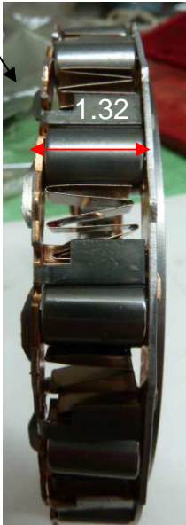
Your new sprag 1.32 cm wide same as mine original