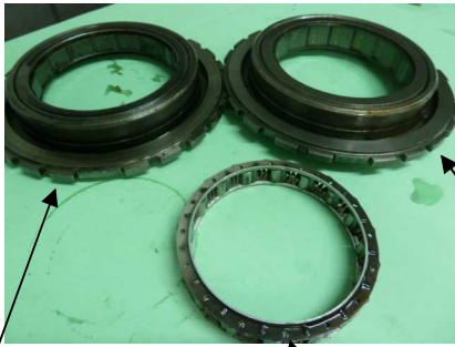
Old cam roller clutch