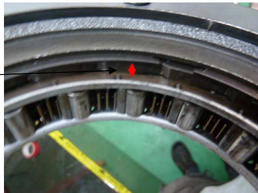
Place left by old/new Sprag in case saver /cam roller clutch, not acceptable for well function

Should be around 1.7 cm to correctly fit in the all width of the innercam, has to be 87-up 4L60 transmission sprag